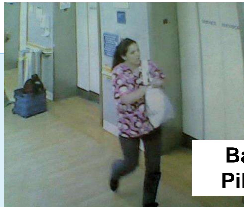
Baby is in Pillowcase